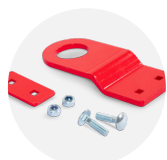
Crane lifting eyes CLEK