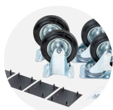
Castor kit CAS160-KS-FX-SB-CP